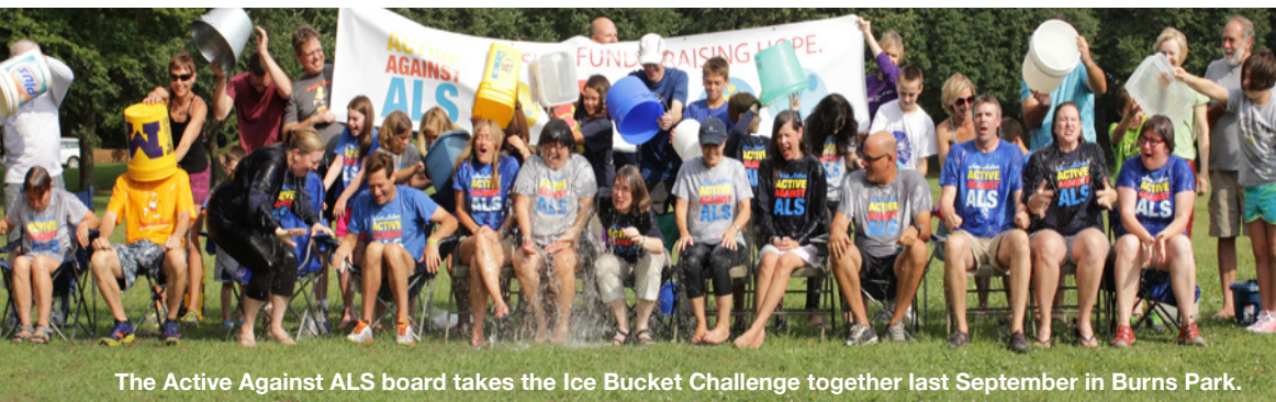
The Active Against ALS board takes the Ice Bucket Challenge together last September in Burns Park.